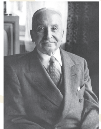
Von Mises advocated pricing mechanisms as the basis for long term economic sustainability.

Companies have large cash reserves now. Some like Microsoft or Apple have enough to finance a smaller country! In general too, companies, like individuals, have been paying off debt at a record pace (Individuals have a ways to go still). When you mix them all together – historically weaker top line growth, lots of cash and debt reduction – it suggests they are cautious on the outlook. Sure, some will return it to shareholders through share buybacks or special dividends, but they want the ability to adapt to conditions.