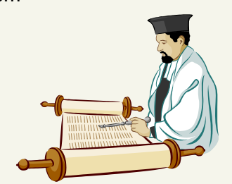
We take our "studies" seriously