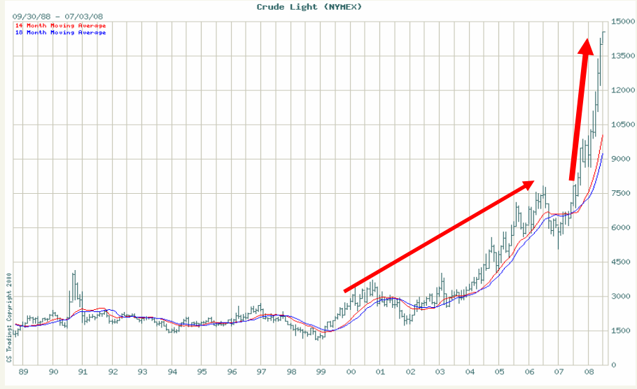
Up, up and away: Oil broke out big in 2004, but can its parabolic nature last?

This is a list of common mistakes people make when investments go parabolic. 1. Over concentration: they put too many eggs in that one exciting basket. 2. Over confidence: