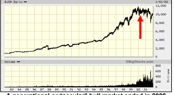
A generational or "secular" bull market ended in 2000

As I rode the chairlift on the slopes of Whistler I phoned back to my office to check-in. My assistant explained to me that the NASDAQ was under some big selling pressures, big enough to instantly bring to the forefront of my mind the historical market research I had been doing.