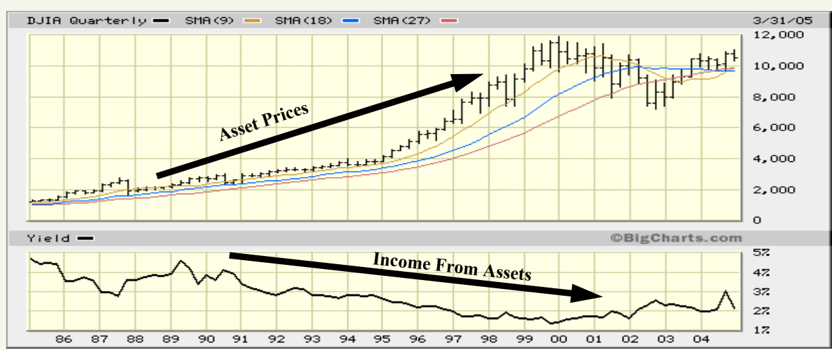
Rolling Dividend Yield of the Dow Jones Industrial Average

This newsletter is not to be considered as offering investment advice on any particular security or market. Please consult a professional or if you invest on your own do your homework and get a good plan, before risking any of your hard earned money. The information provided in The Rampart, a publication for clients and friends of CastleMoore Inc., is intended to provide a broad look at investing wisdom, and in particular, investment methodologies or techniques. We avoid recommending specific securities due to the inherent risk any one security poses to ones' overall investment success. Our advice to our clients is based on their risk tolerance, investment objectives, previous market experience, net worth and current income. Please contact CastleMoore Inc. if you require further clarification on this disclaimer.